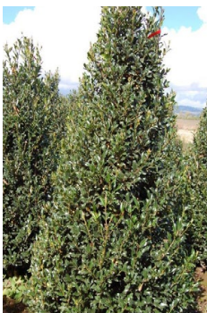
Common Name: Golden Girl Holly Scientific Name: Ilex x meserveae 'Golden Girl'

A medium sized evergreen tree, Golden Girl Holly is one of the first cultivars of holly with yellow berries in the world. A tree that bears plentiful golden berries against the luscious dark green leaves, it is a fabulous specimen to the landscape. The bright berries begin their show beginning around end of November and continue through the December holiday season. Golden Girl Holly typically reaches between 12'-15' in height and approximately 2'-6' in width with a beautiful pyramidal habit. Preferring full sun to part shade it is a great specimen tree, border plant, or hedge.