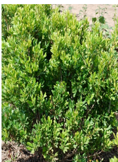
Common Name: Northern Bayberry Scientific Name: Morella pensylvanica

A native, low-maintenance shrub, Northern Bayberry is best known for its fragrant bright green foliage through most of the seasons. In the winter however, it is best known for its plentiful, also fragrant, berries in which the plant gets its name. A fun fact about these berries is that they are frequently used to make candles as they contain their own wax-like substance. This shrub prefers full sun but can tolerate a part shade condition. Reaching 5'-10' in height and the same in width it is a great, deer resistant plant for a variety of uses such as native plantings, dune revitalization, hedging, and rain gardens.