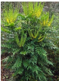
Common Name: Charity Oregon Grape Scientific Name: Mahonia x media 'Charity'

A large, statuesque shrub, Charity Oregon Grape reaches 10'-15' in height and in width. A deep shade lover flowering through the winter season right in time for the Holidays in December. The sunny yellow blooms are a beautiful site in the winter landscape with purplish-blue berries that follow in the Summer months. It is a plant tolerant of some drought conditions once established. Utilize this deer resistant plant for a woodland garden, border planting, or even as a hedge and it will be sure to show off its true beauty.