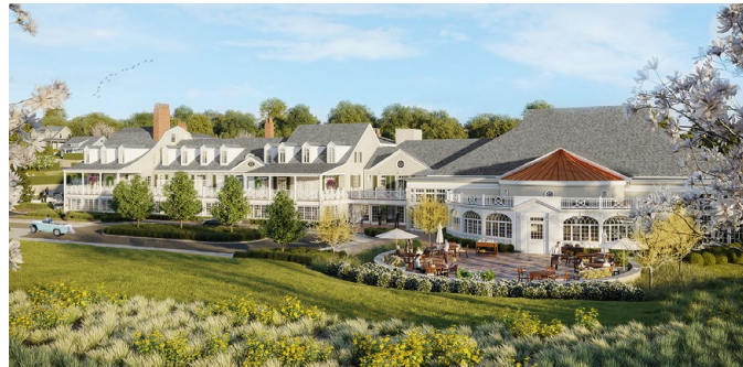
Conceptual 3-D rendering by RDA International

Araiy's Design is proud to be the landscape architects for the restoration of the historic Canoe Place Inn in Hampton Bays. After a 12 year permitting process, construction commenced in late 2019 and has made great progress throughout 2020. According to the Hampton Bays Historical Society, it is considered the oldest inn in the United States containing a rich and multilayered history that started as a trading post in the 1600's. The Inn was established in the 1700's and occupied by British troops during the Revolutionary War. Throughout its history, the inn has hosted the likes of President Franklin Delano Roosevelt, Cary Grant, Lucille Ball, and Albert Einstein. Rechler Equity Partners purchased the property in the 2000's, saving the inn from demolition. When complete, the six acre property will include the restored inn featuring a 350-seat catering venue, a 90-seat restaurant with outdoor entertainment spaces, 20-guest room suites, and a swimming pool. Additionally, five restored cottages will offer accommodations for extended stays.