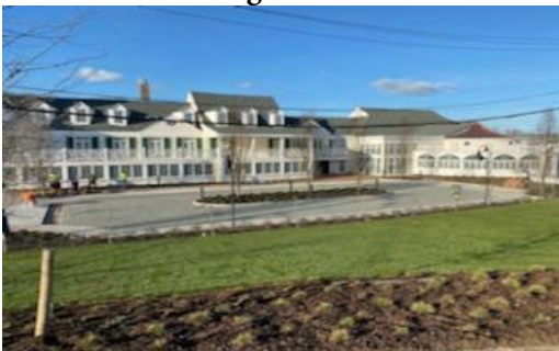
Plant installation, December 2020